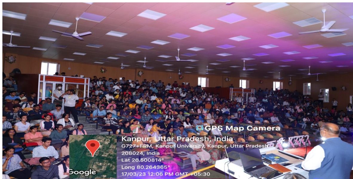
Lecture Hall cum Mini Theater