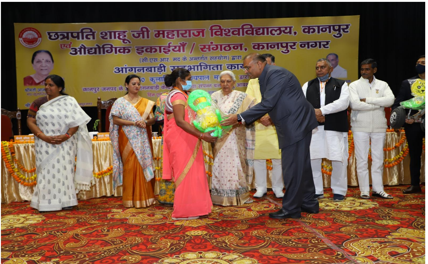
University Function in Auditorium