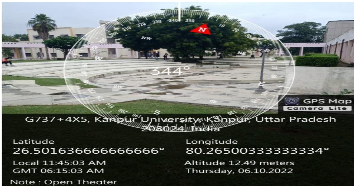
Open Air Theatre