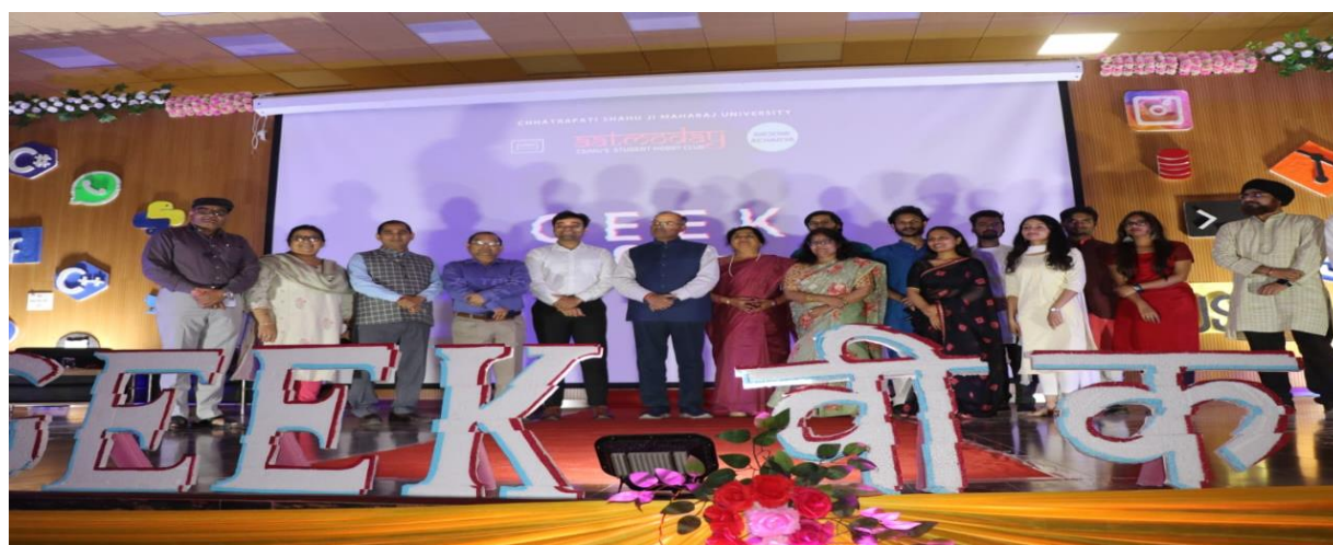
Geek Week Function in Mini Theatre