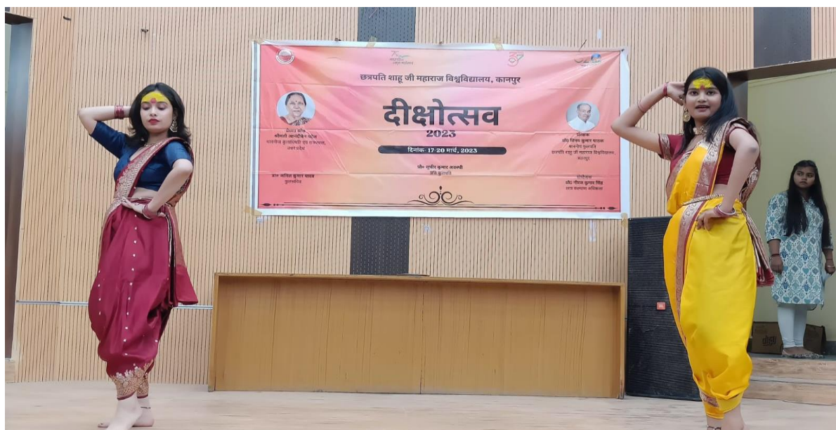
Performance by University Students in Cultural activity in Mini theatre